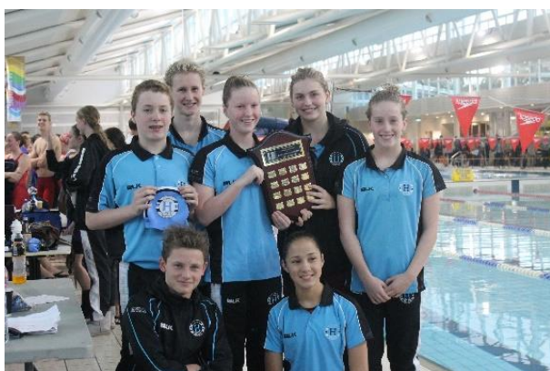
HUNTER SC MEMBERS – CHAMPION CLUB

The Quality Club Team Rankings – Combined Team Scores – Club Champion for 2017 Short Course was won by Woy Woy Swim Club, second being Hunter SC and third was Mingara Aquatic Swimming Club.