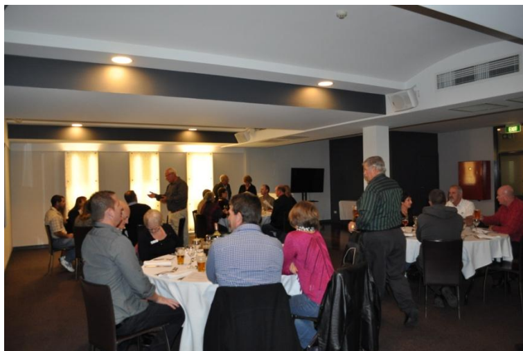
Technical Officials dinner guest