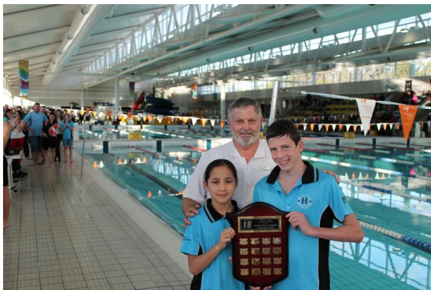
CVSA Short Course Champions 2013 – HUNTER SWIM CLUB

At the end of the two days of competition the Newcastle club Hunter were declared CVSA Club Champions scoring 1378.5 points, 2 nd place to Kincumber Pacific Dolphins – 1359.5 points and 3 rd place to Mingara Aquatic 1242.5 points.